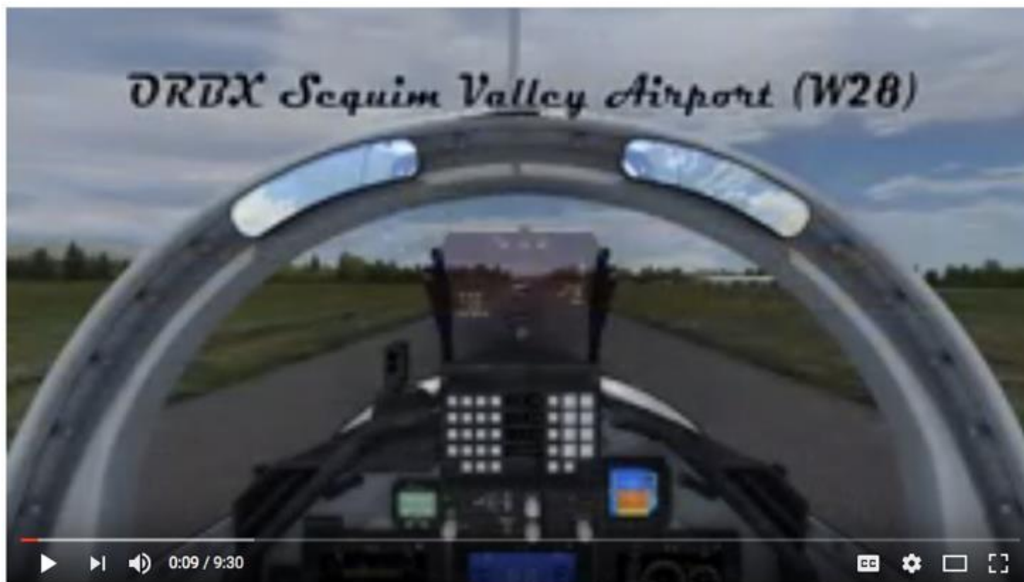
ORBX Sequim Valley (W28) (P3D)

ORBX released another PNW airport recently and, since I live in PNW, it was a must-buy. How did it stack up?