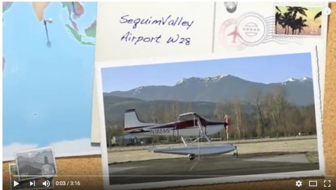
Sequim Valley Airport W28

This slideshow video is about Sequim Valley Airport, It includes airport facilities, local flying, planes and people.